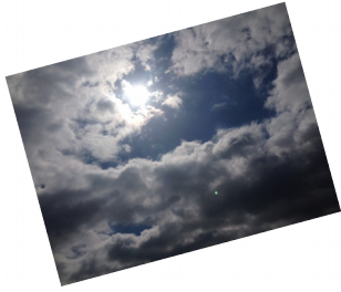
PHOTO COMPETITION- Not too late to enter! Closing date 19 th June . Entry details on Forum website. Don't forget to vote for this year's best photo showing ACTION. Under 12s, 12+ and adults categories. Voting on Crosspool Forum website from Tuesday 21st June. View all entries, meet the photographers and see the winners announced at St Columba's on Wednesday 29 th June at 4pm.